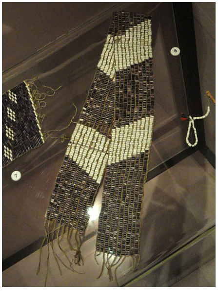
Wampum belt, Iroquois and Agonkian, commemorating peace treaty in the 17<sup>th</sup> century. Exhibit from the Native American Collection, Peabody Museum, Harvard University, Cambridge, Massachusetts, USA. Image is in the public domain.

*This activity may also be done in pairs.